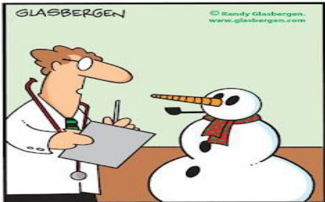
"Lose some weight, quit smoking, move around more and eat the carrot."